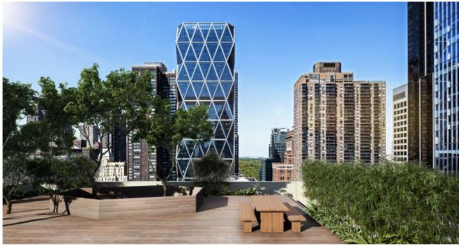
Fifty Third and Eighth.

Fifty Third and Eighth: Situated in the heart of Hell's Kitchen, HFZ Capital Group's 262 residence condominium Fifty Third & Eighth features a rooftop terrace offering 360 degree, unobstructed views of the Manhattan skyline, Hudson River and Central Park, as well as lush gardens designed by Terrain and polished decking throughout featuring BBQ grills, picnic tables and a sundeck.