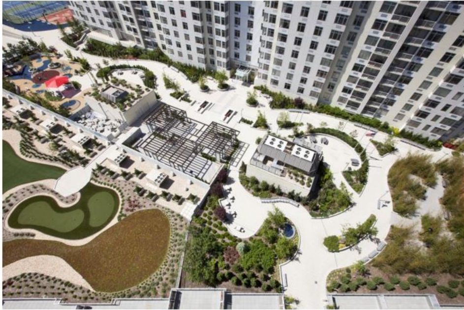
The Grand at Sky View Parc.

The Grand at Sky View Parc , a three-tower luxury condominium in Flushing, Queens, rests on a six-acre rooftop, allowing residences to have access to an endless variety of outdoor activities: two tennis courts, a basketball court, running track, children's playground, dog run and putting green. Additionally, the development hired a feng shui master to create several areas within the residence to abide by such principles such as landscaped plants, fountains purposely placed near entrances, curved roof forms and more.