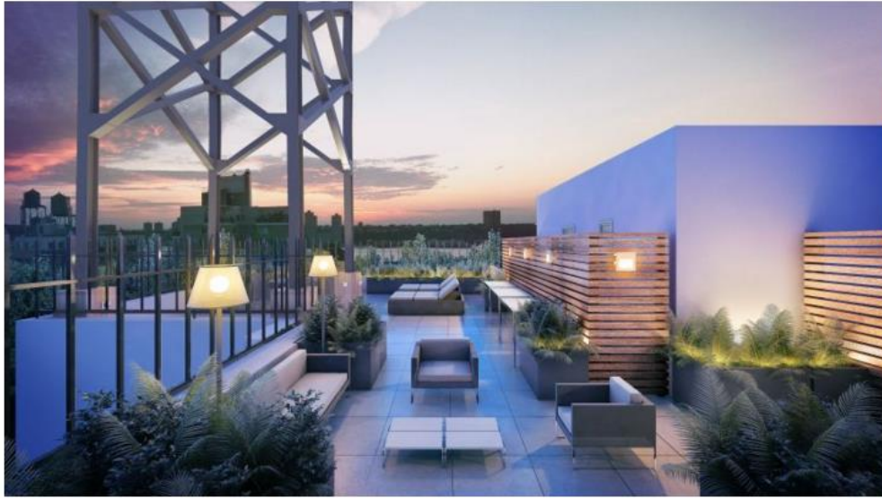
393 West End Ave.

393 West End Ave , Simon Baron Development's newest luxury conversion property, features a resident roof deck with breathtaking views of the New York City skyline and Hudson River that is perfect for entertaining and relaxing.