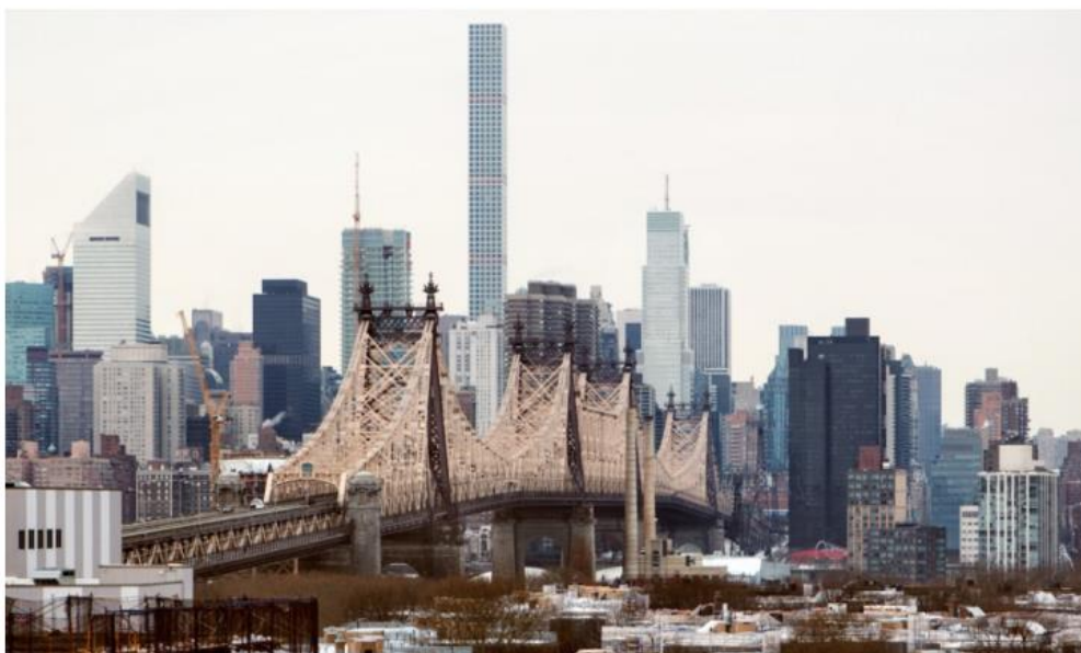
The Baker House.

Liv@ , a 39-unit condo in Long Island City, features a state-of-the-art rooftop fitness center, which opens up onto a resident-only rooftop deck. The outdoor space features BBQ stations and a lounge where residents can take in the views of the East River and the Manhattan skyline. Modern Spaces is handling the marketing and sales for the project.