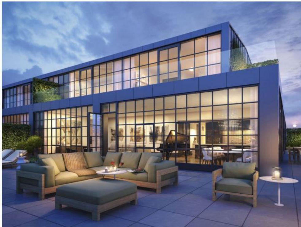
51 Jay Street.

51 Jay St , the 74-home luxury warehouse conversion nestled amongst the Dumbo cobblestones, offers residents unmatched views of the Manhattan skyline and surrounding waterfront Brooklyn neighborhood at the rooftop terrace. Co-developed by Slate Property Group and Adam America Real Estate, the property will be home to an outdoor shower and fireplace as well as an immense outdoor kitchen, perfect for a BBQ or quiet dinner for two.