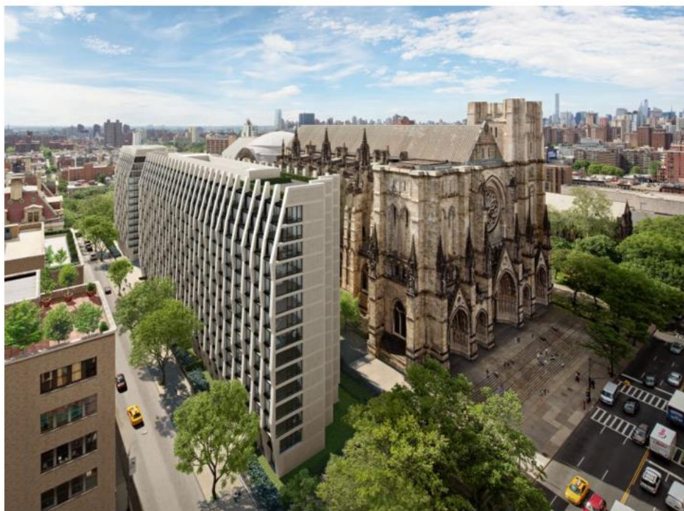
Enclave at the Cathedral

Enclave at the Cathedral: Designed by Handel Architects, Enclave at the Cathedral, The Brodsky Organization's two residential rental towers featuring 430 residences in Morningside Heights, feature over 10,000 square feet of indoor and outdoor amenities ideal for relaxing and unwinding, including two roof decks with views of the City, Morningside Park and The Close.