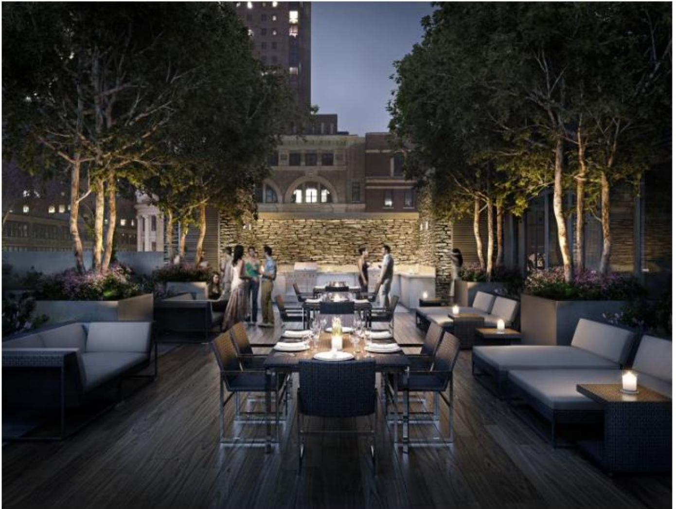
388 Bridge Street

388 Bridge Street offers a summer movie series (and popcorn machine), on its 4,950-square-foot outdoor terrace on the fifth floor. Enjoy while you grill, too!