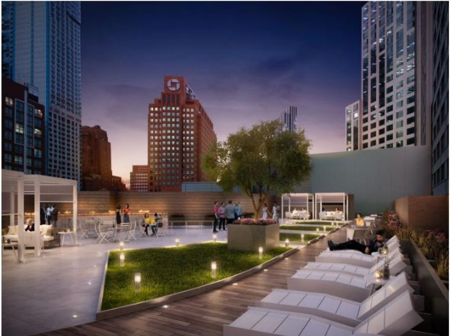
7 DeKalb Avenue.

7 DeKalb Avenue offers a 6,000-square-foot public terrace with plant and vegetable gardens, lawn space, and a bar counter.