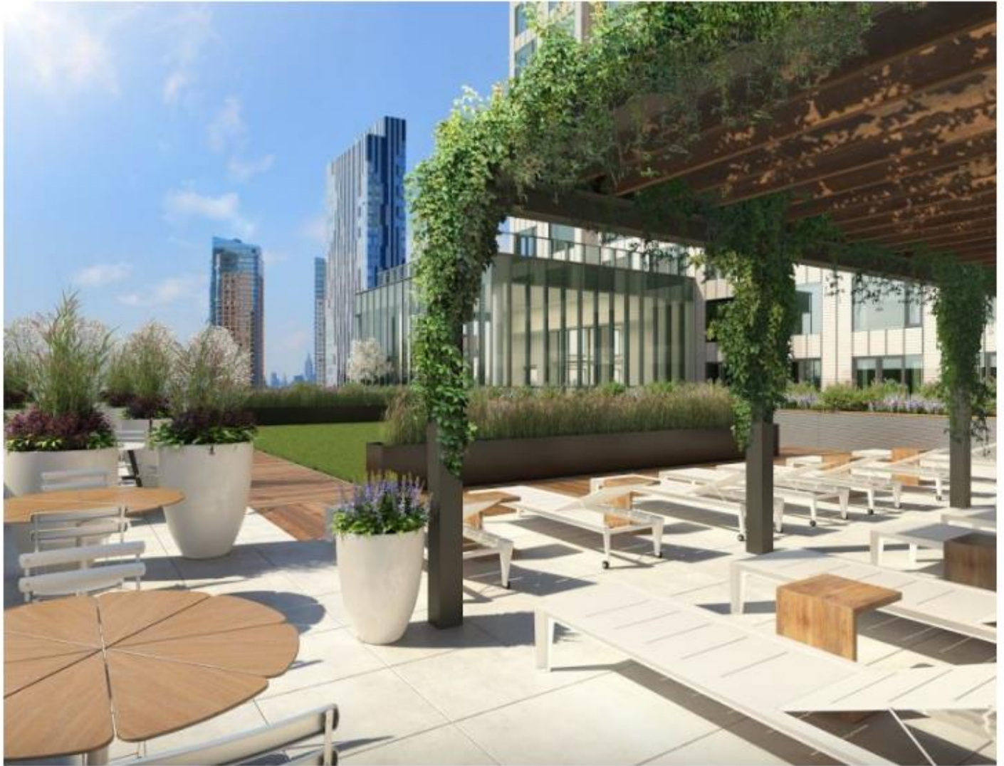
City Tower. Photo by Archpartners.

City Tower offers residents an expansive green terrace to relax on in the heart of Downtown Brooklyn. The 18th floor green terrace features a landscaped lawn at the center and a shade trellis as a viewing pavilion for reading, working, or to view the various additional plantings—including a resident gardening area for vegetables and herbs.