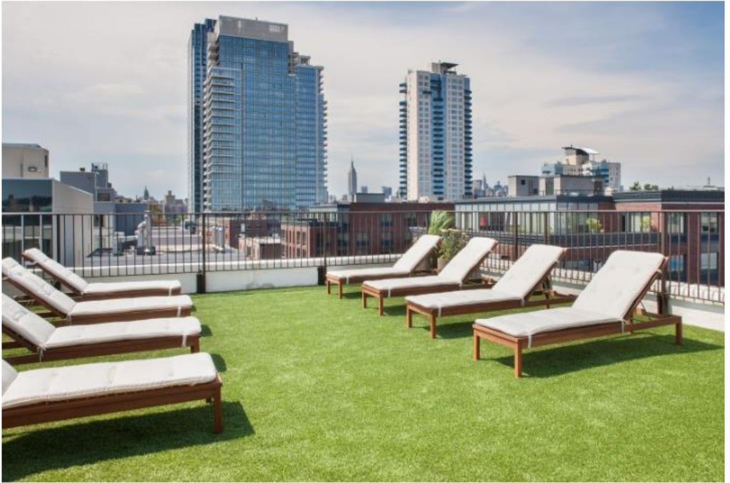
The Lewis Steel Building.

The Lewis Steel Building offers residents private rooftop cabanas, a furnished roof terrace with sun decks, a common BBQ area, a bocce court, and a vegetable garden—rendering it the perfect hangout spot during the summer months.