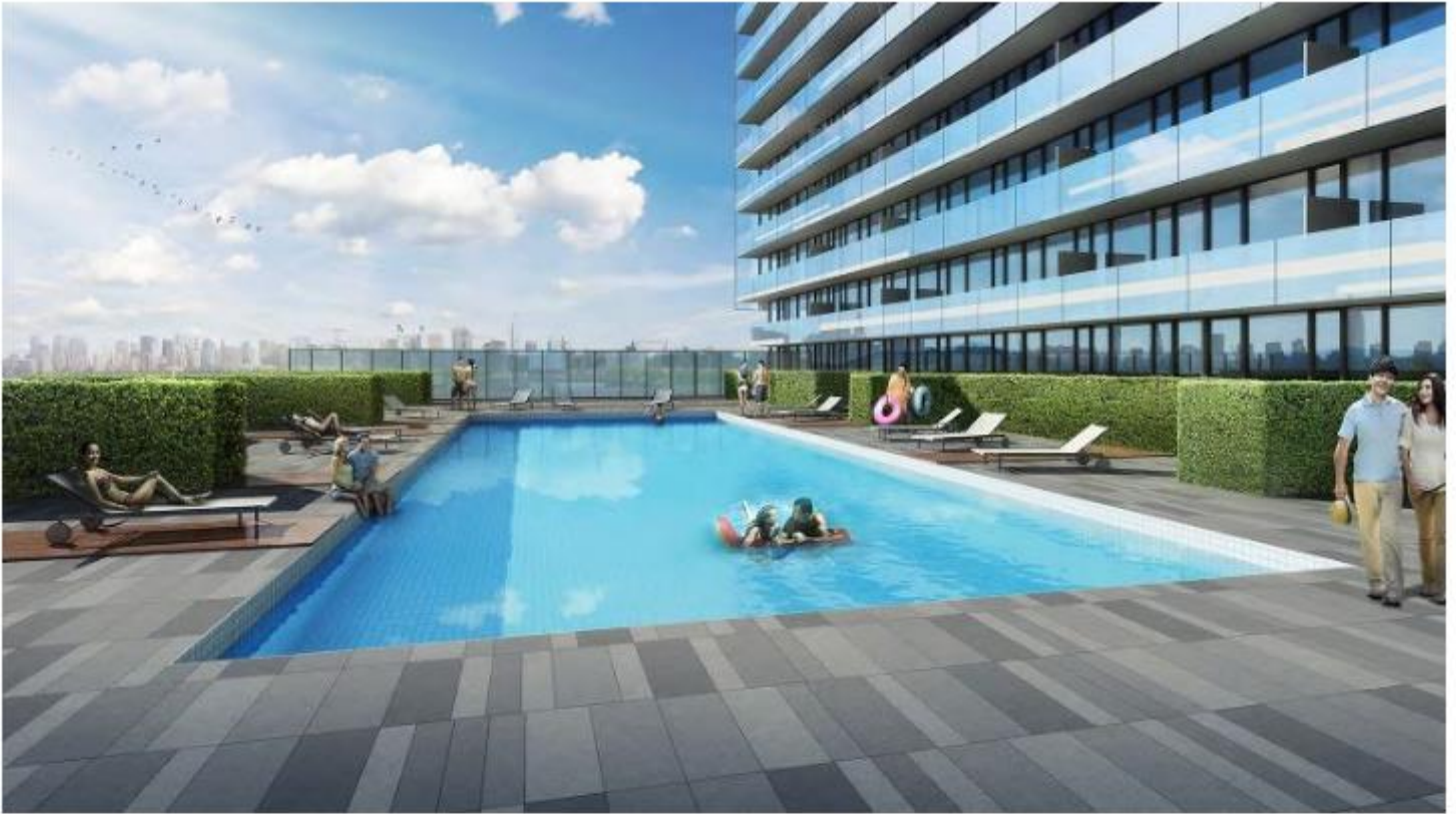
The Grand at Sky View Parc.

The Grand at Sky View Parc features a private seven-acre rooftop park, allowing residents to have access to an endless variety of outdoor activities. Amenities include two tennis courts, a basketball court, running track, yoga area, and a putting green.