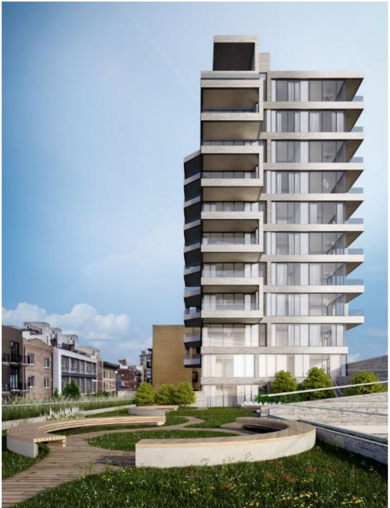
190 South 1st Street.

At 190 South 1st Street residents will enjoy a landscaped terrace and garden lounge with lushly planted seating and picnic areas!