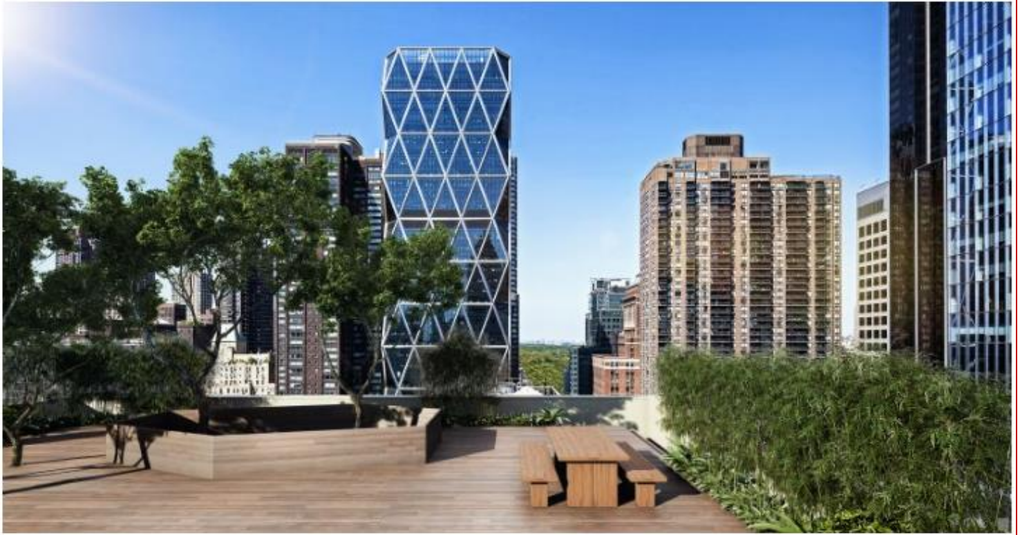
Fifty Third and Eighth.

Fifty Third and Eighth offers a second floor terrace that takes up a full city block with lush greenery including ginkgo trees, native grasses, perennials, and other seasonally diverse plants. There is also a zone designed to accommodate open-air fitness classes.