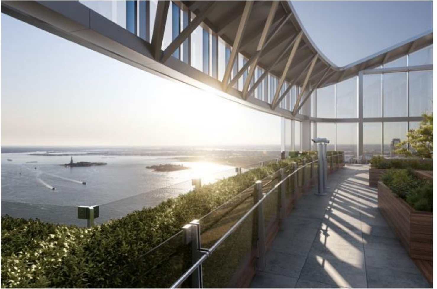
50 West.

50 West is bringing the outdoors inside by offering residents access to a landscaped observatory deck almost 800 feet in the air, in addition to a 60-foot mosaic-tiled pool situated in the building's Water Club.