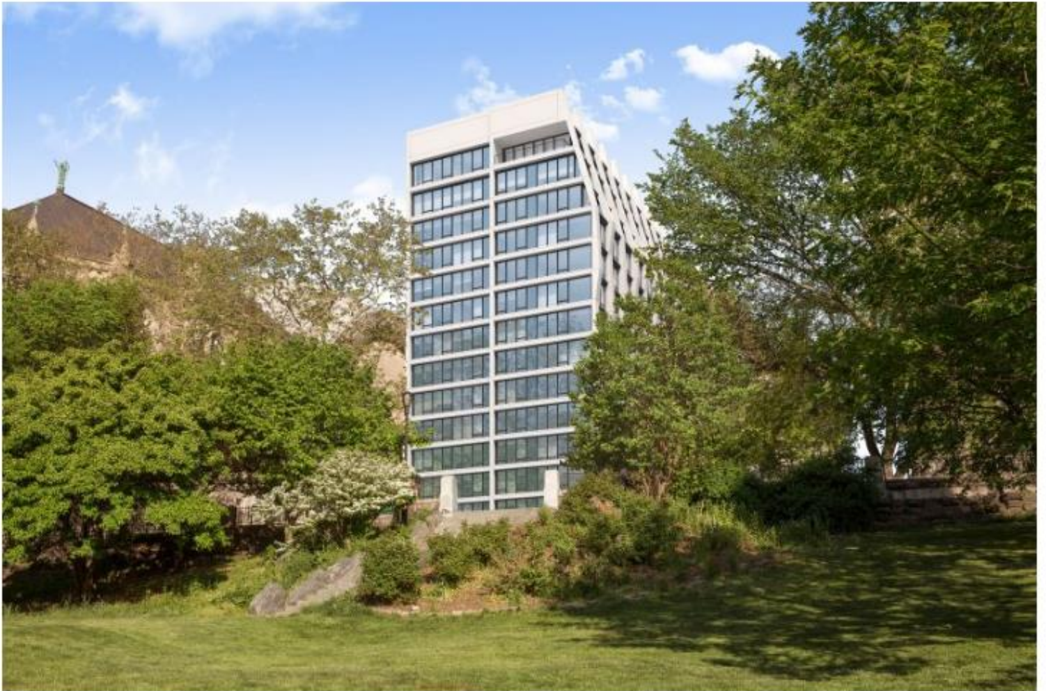
Enclave at the Cathedral.

Enclave at the Cathedral partnered with Harlem International Film Festival to offer residents screenings and director Q&A's in June and July.