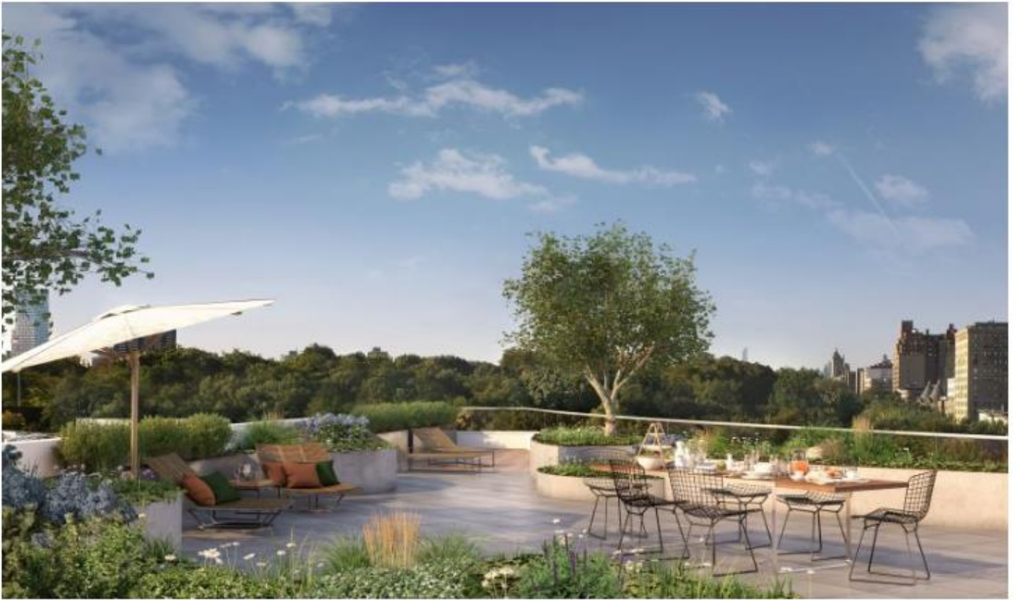
Circa Central Park.

Residents at Circa Central Park can enjoy the summer warmth on the shared rooftop terrace which boasts a grill perfect for a family BBQ. Home-owners can picnic near the water with fully-equipped picnic baskets offered by Circa Central Park.