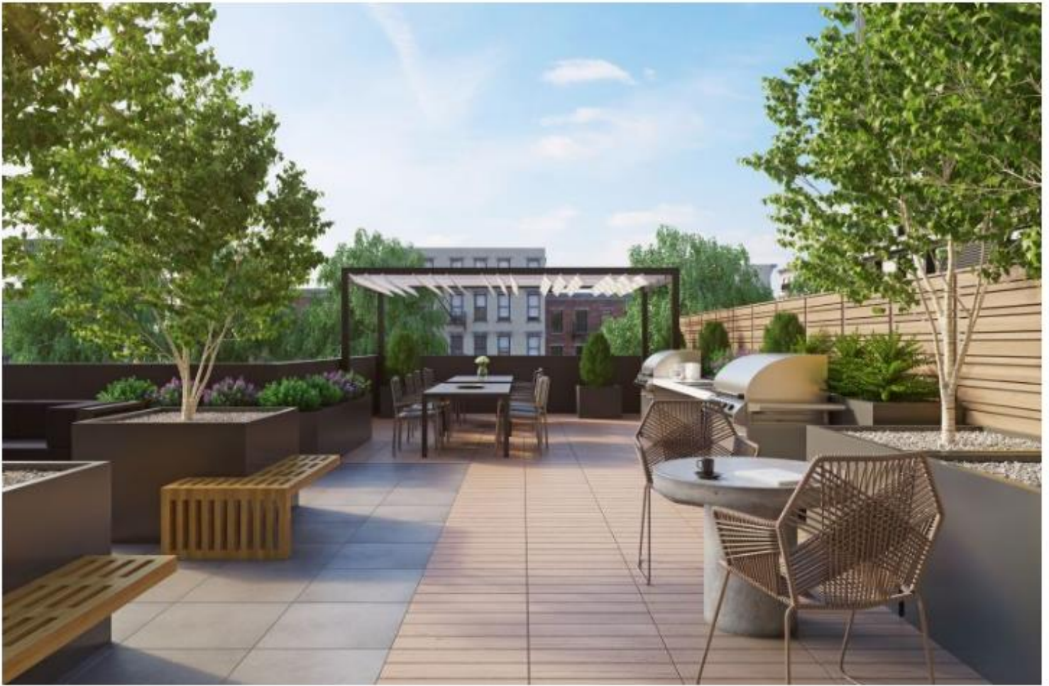
Waverly Brooklyn.

Waverly Brooklyn features an outdoor shower on its rooftop terrace—if you've ever taken a cool outdoor shower on a hot summer day, you'll know that it's as refreshing as jumping in a pool! They have grills too!