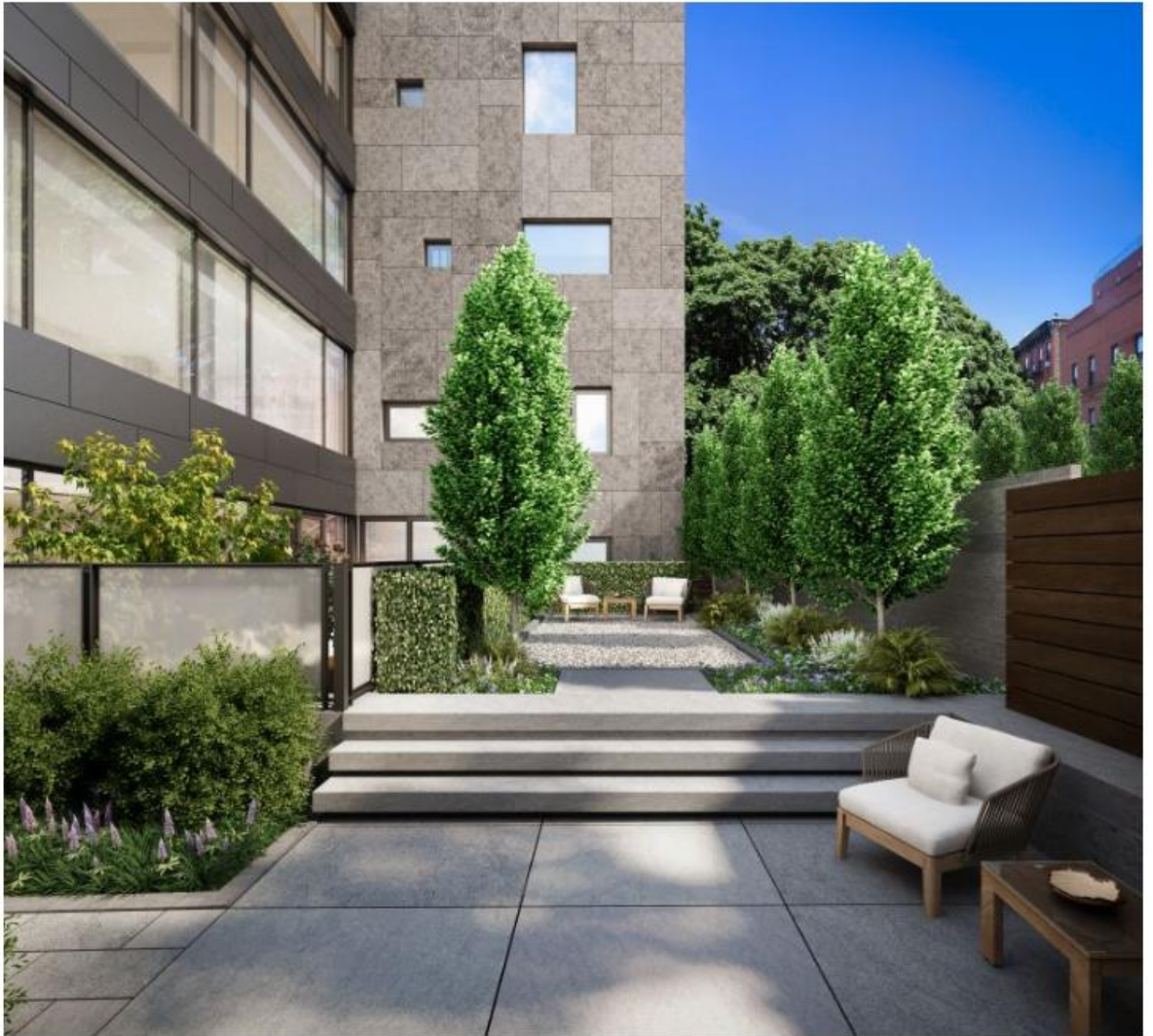
The Residences at Prince.

The Residences at Prince will offer residents access to a private courtyard designed by the famed landscape team, PFI .