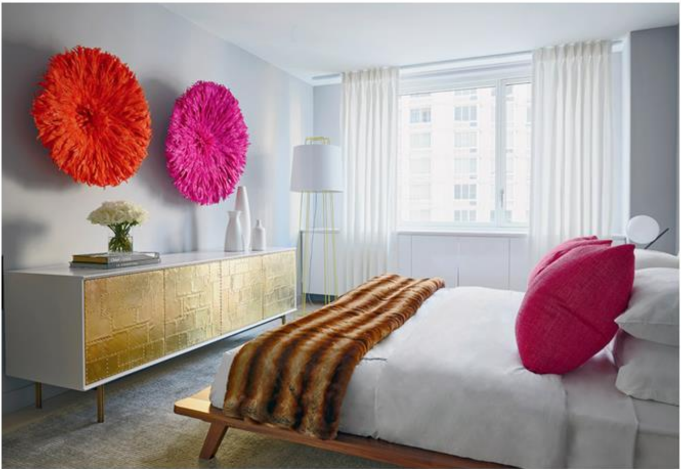
The one-bedroom condo

With interiors by BP Architects, each aspect of the property was meticulously transformed with modern, busy lifestyles in mind, according to the condo website. Amenities include an expansive lobby, 24-hour doorman and concierge, wellness and fitness facilities, a spa terrace, valet dry cleaning service, cold storage, rooftop terrace and lounge, and on-site parking.