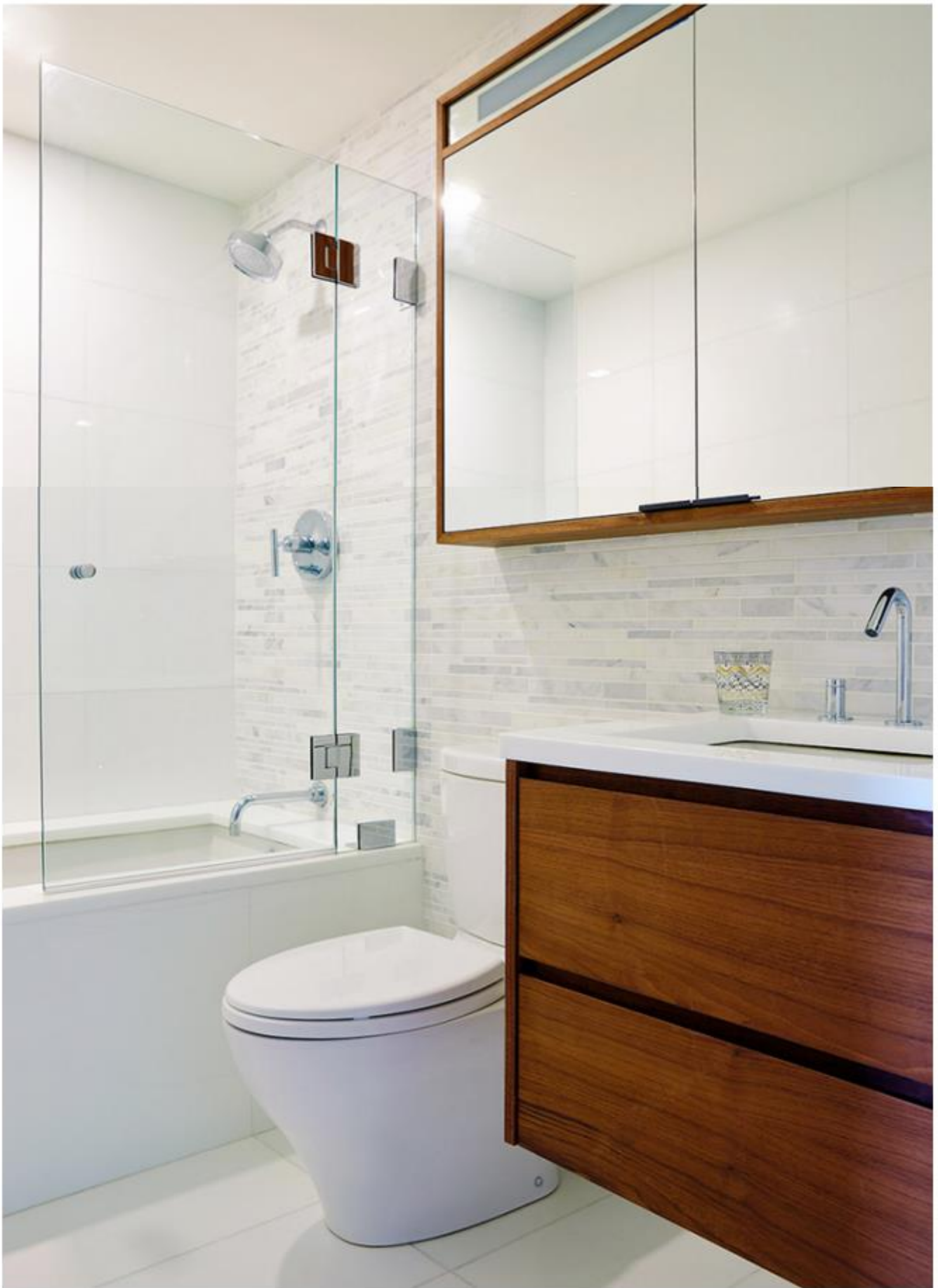
Bathrooms have custom vanities, medicine cabinets fitted with Kohler fixtures, and mosaic tile accent walls.