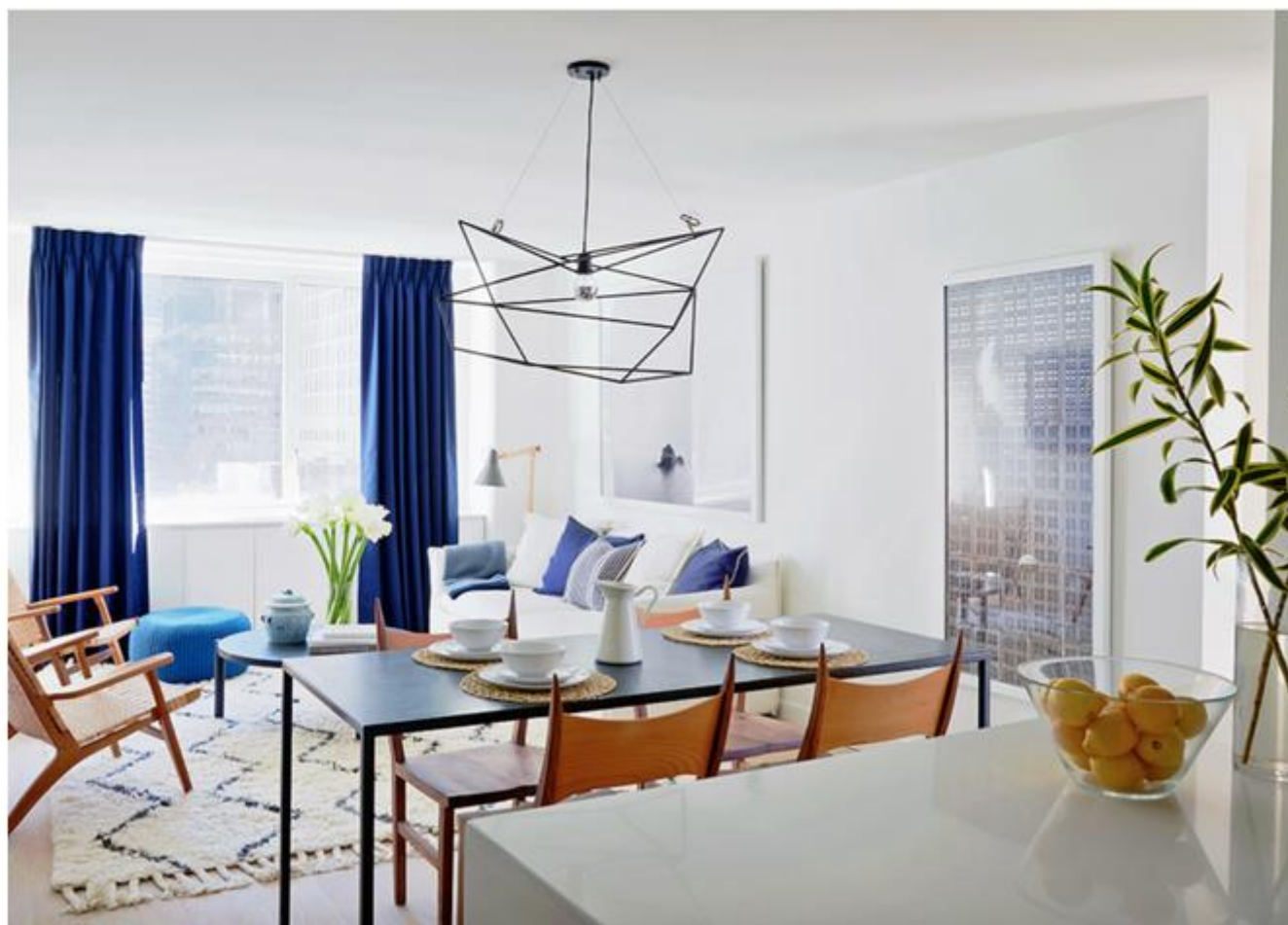
Three-bedroom units boast more spacious living rooms and two full bathrooms.

The 53rd and Eighth condominium showcases one, two and three bedroom units—ranging from $1.1 million to $3.25 million—with luxury finishes, convenient services and modern amenities. Each residence is flooded with natural light, enhanced by oakwood flooring and unobstructed views of the Hudson River to the west and the city skyline to the east. Select units offer private terraces. The homes are crafted to reflect the neighborhood’s bold character and distinct charm.