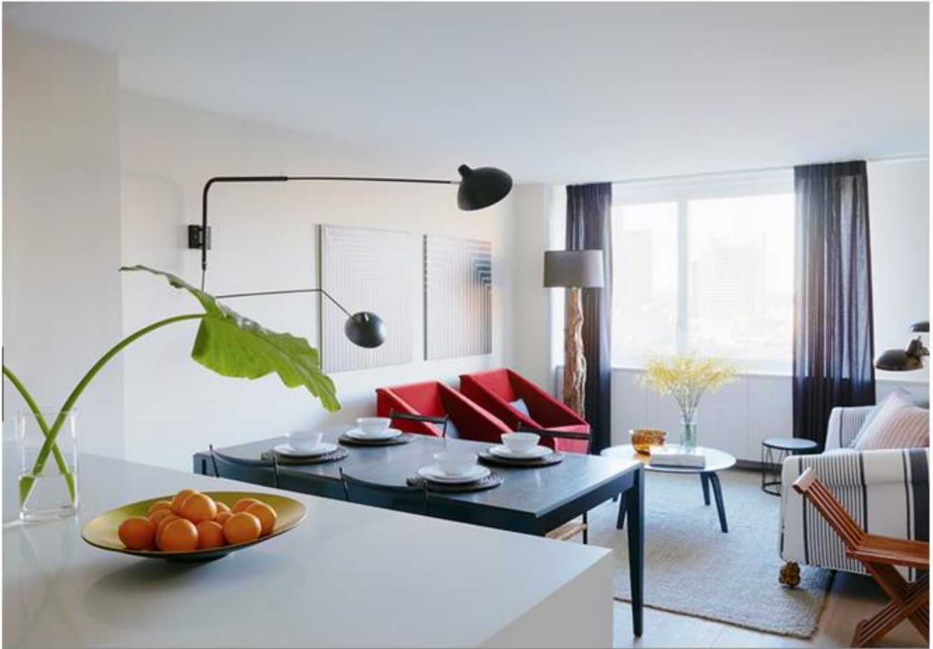
The condos (like this two-bedroom unit) showcase contemporary interiors by BP Architects and furnishings by ASH NYC.