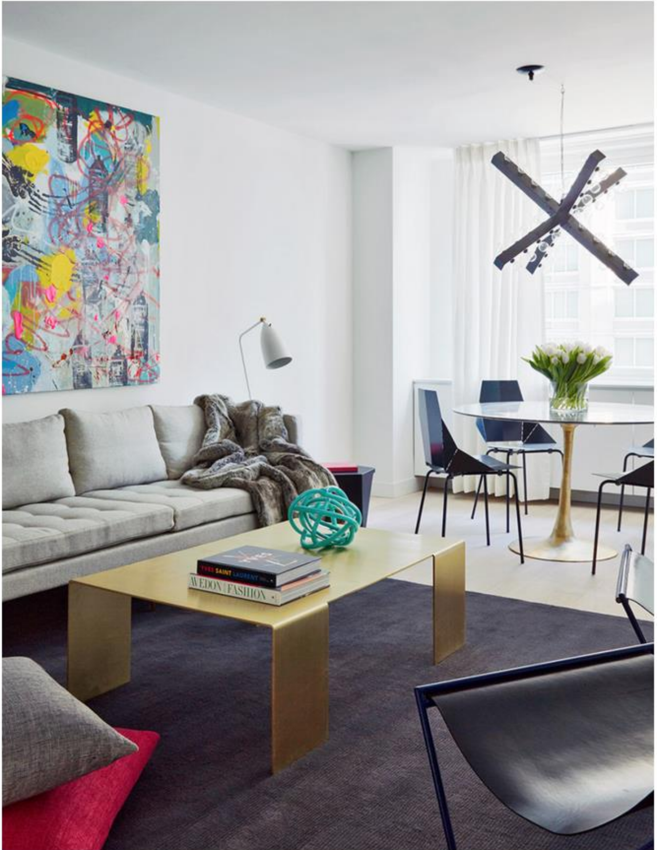
All units at Fifty-Third and Eighth are flooded in natural light with Hudson River or city skyline views.