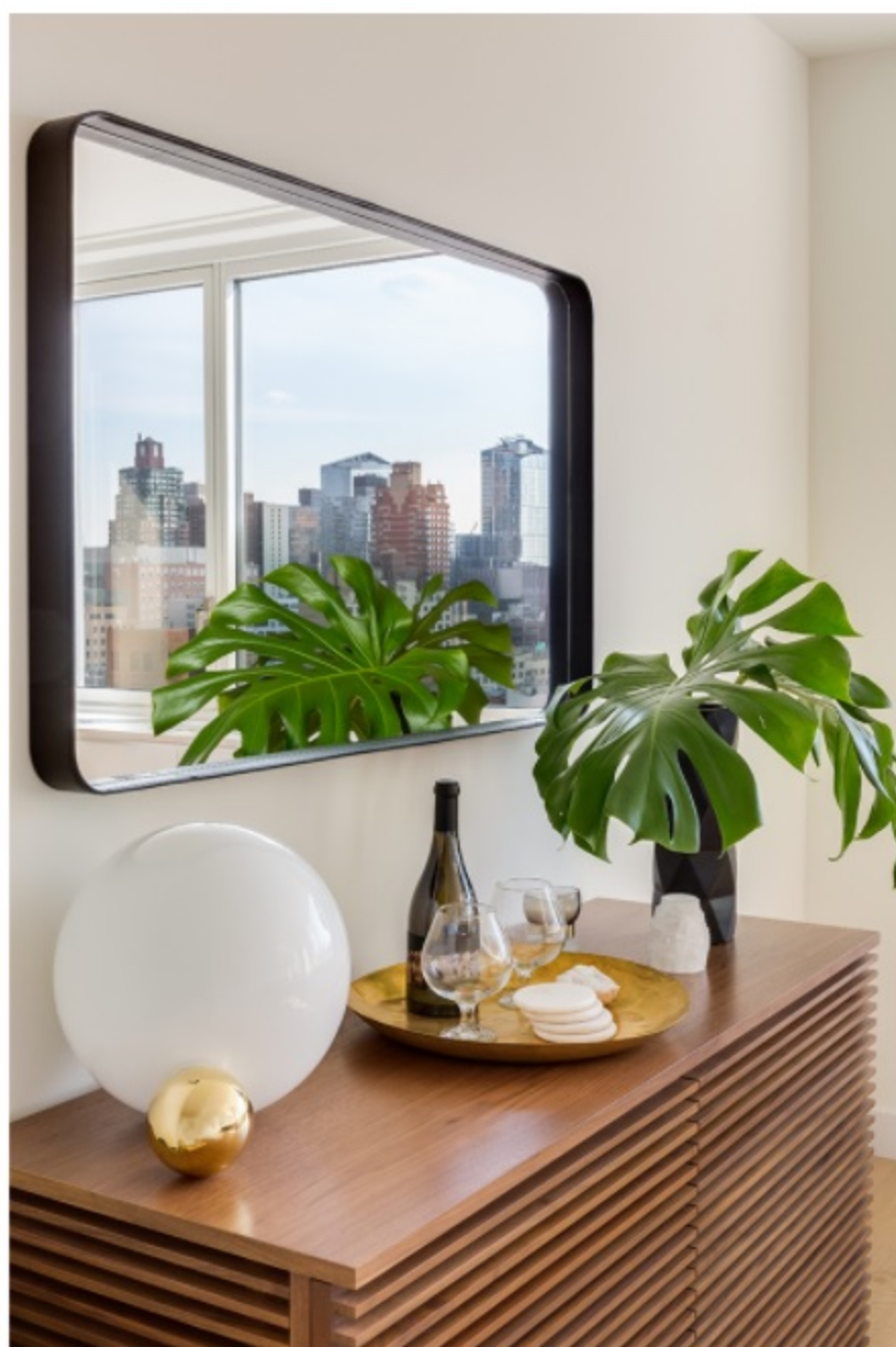
Fifty Third and Eighth

This space is currently listed at $3.5 million.