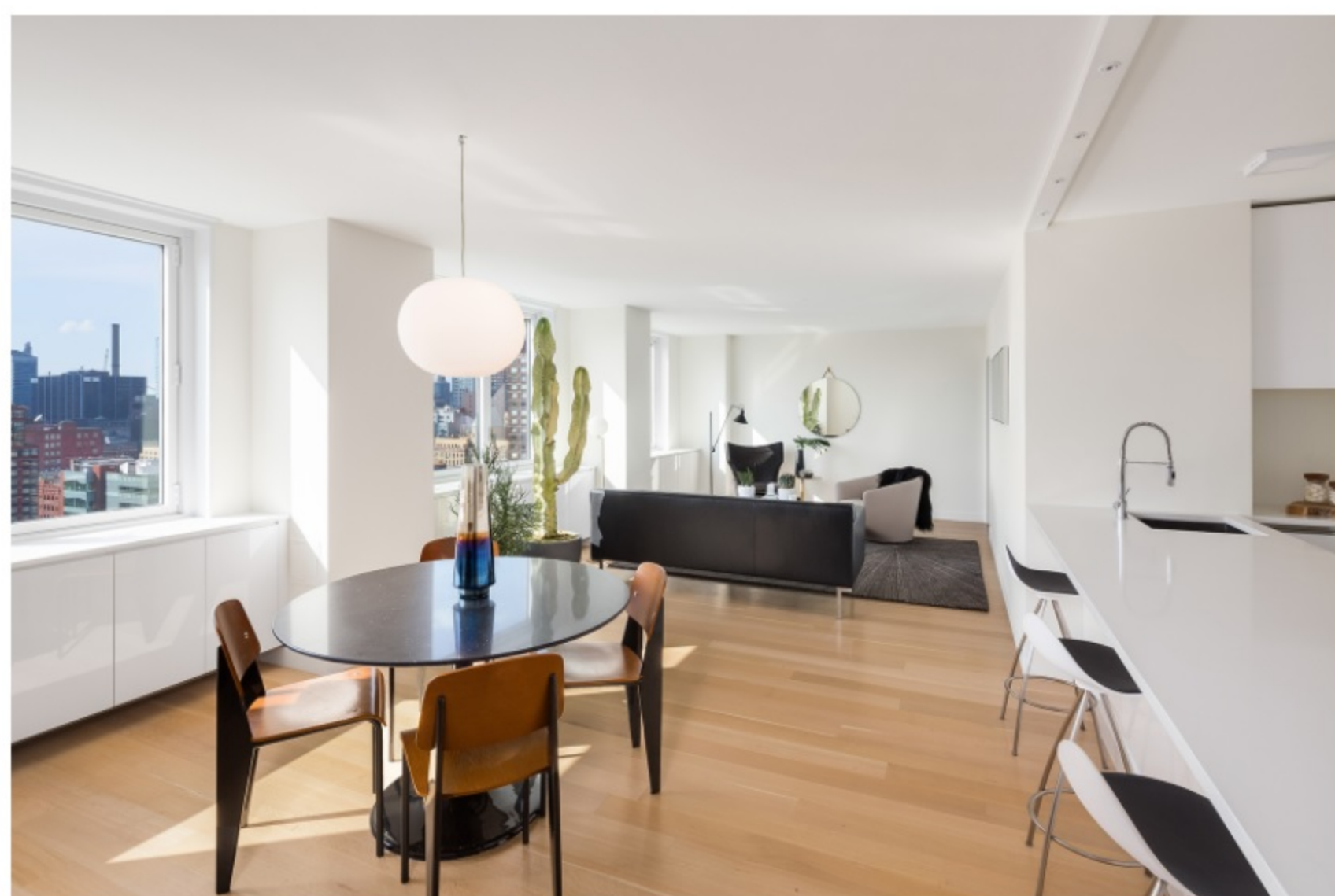
Fifty Third and Eighth