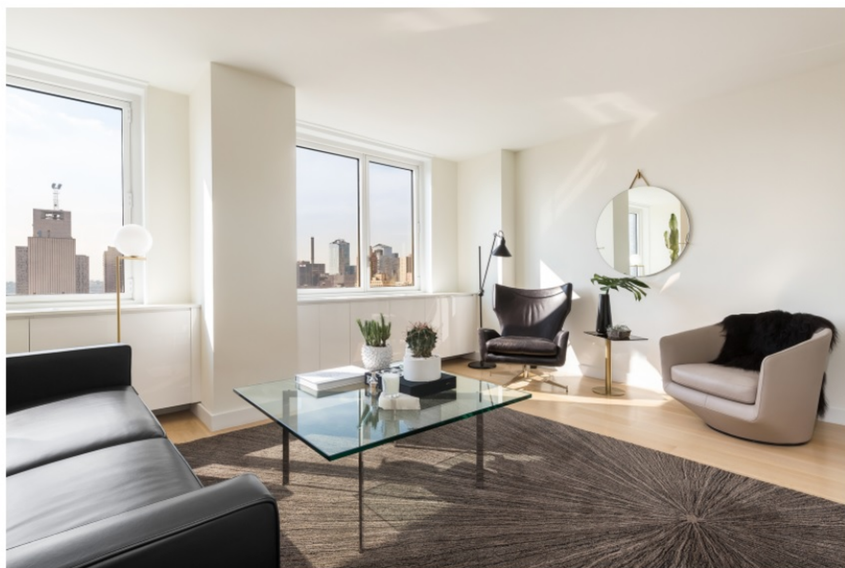
Fifty Third and Eighth