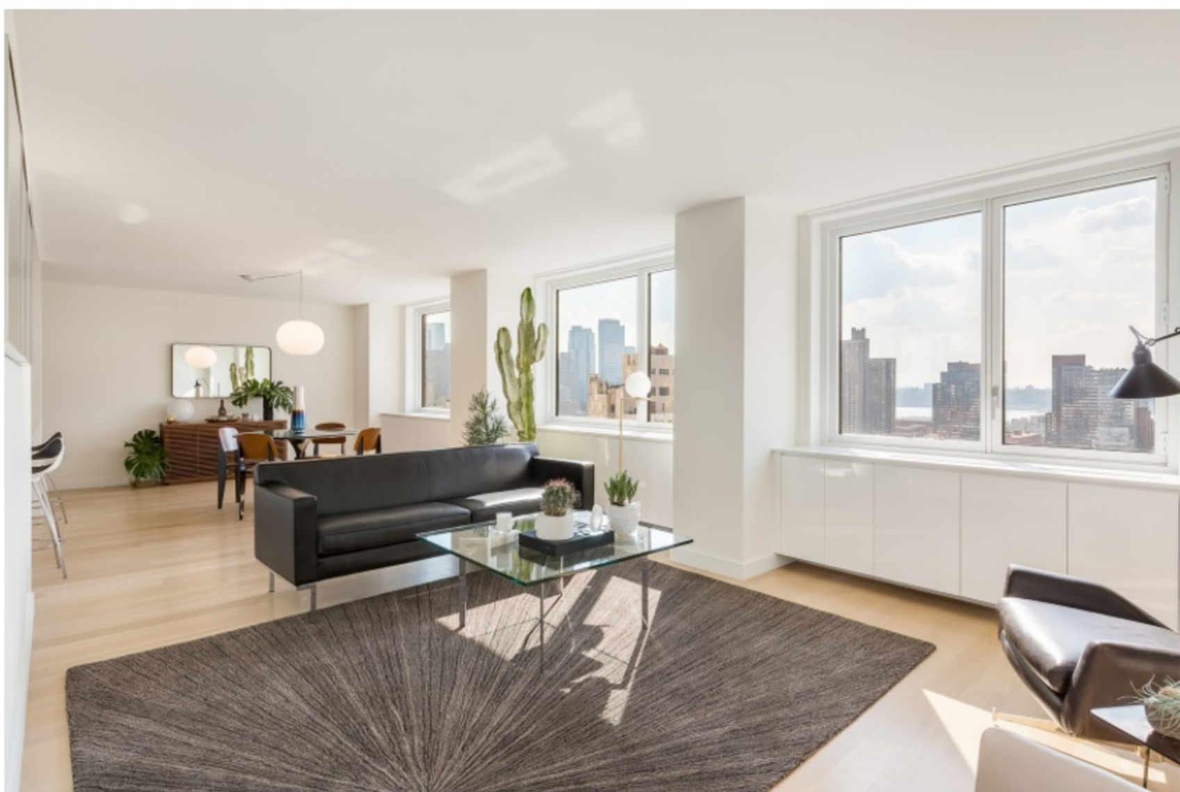
Fifty Third and Eighth